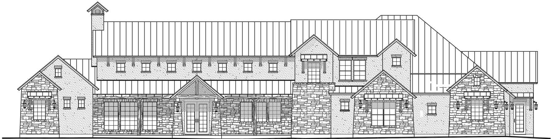
Front Elevation SCALE: 1/4" = 1'-0"