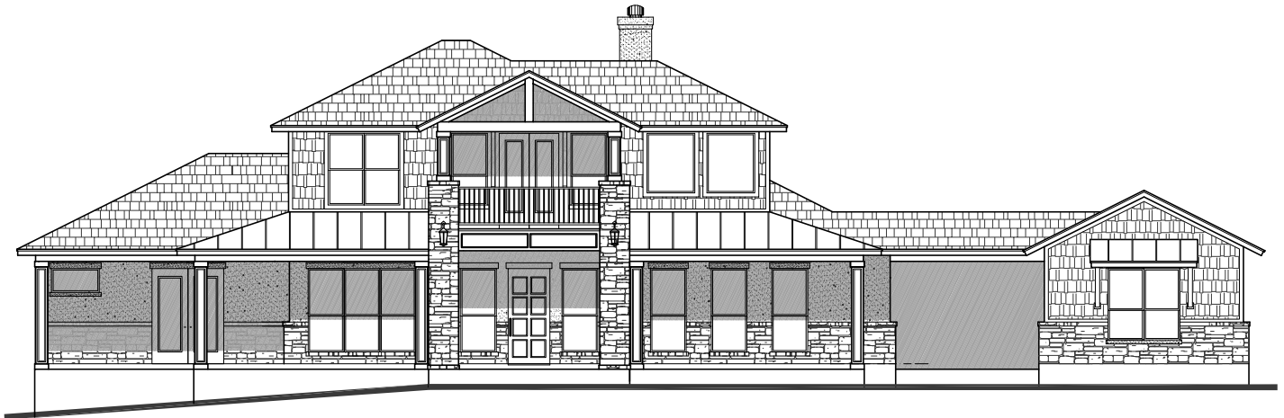
Front Elevation SCALE: 1/4" = 1'-0"