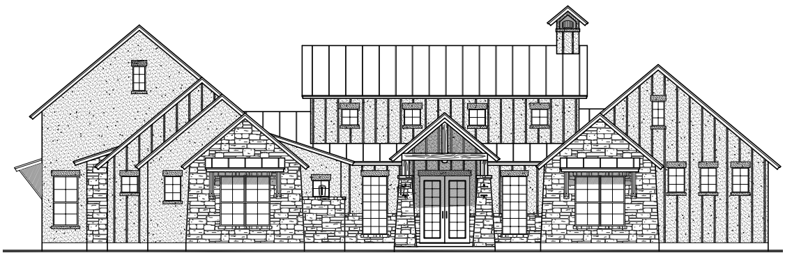
Front Elevation SCALE: 1/4" = 1'-0"