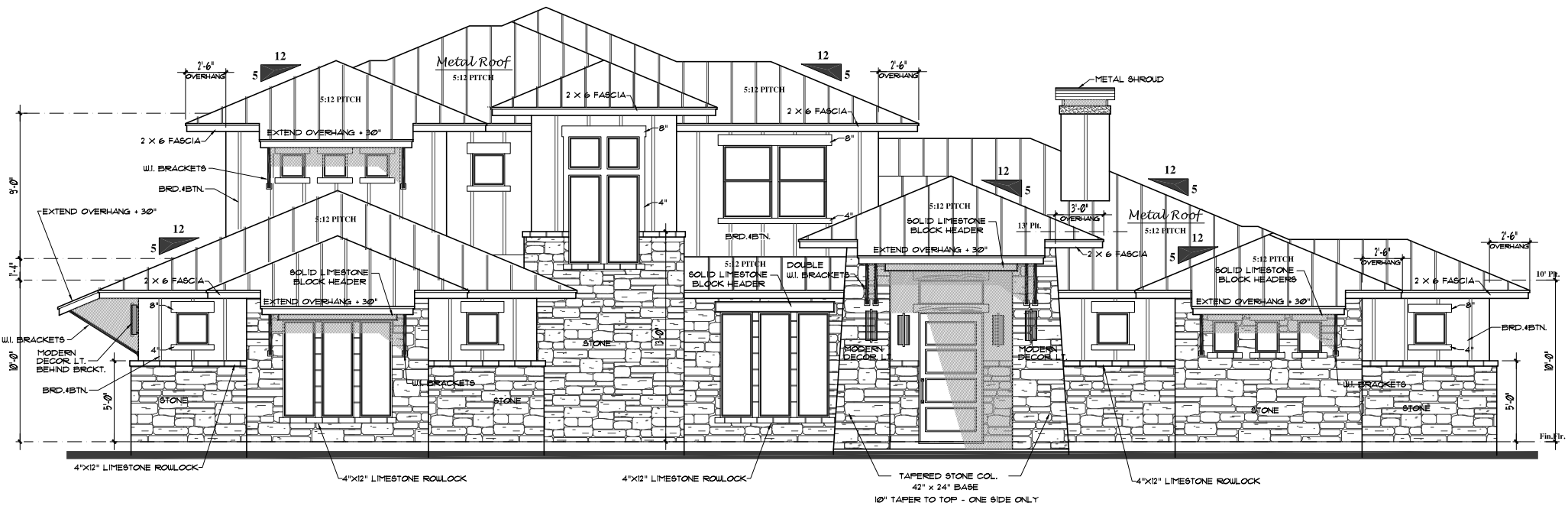
Front Elevation SCALE: N.T.S.